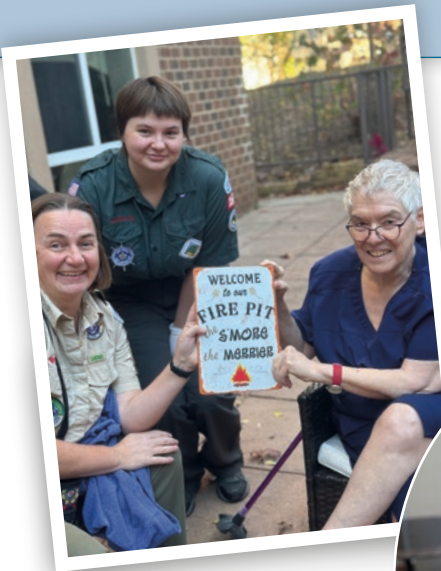
Who's ready for tasty Smores'?