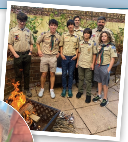
Troop 1566 enjoys the campfire at Tall Oaks!

Boy Scout Troops of BSA 1577 came to Tall Oaks to share good times and smores' with the residents.