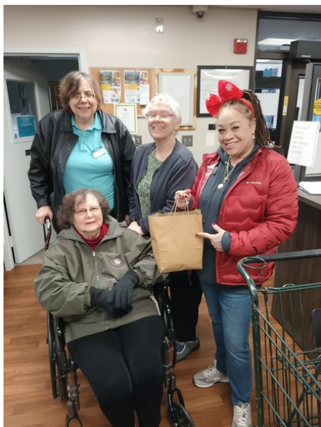
"Residents Bring Donations to Embry Rucker Shelter"